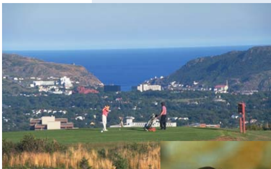
Pippy Park Public Golf Course

Soup & Sandwich Buffet – Admittance by badge. Co-Sponsored by RioCan Property Services, Municipal Assessment Agency and CPTA