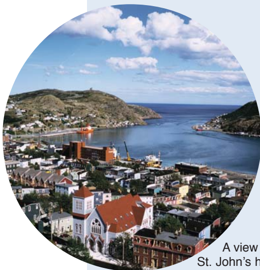
A view of St. John's harbour from The Rooms