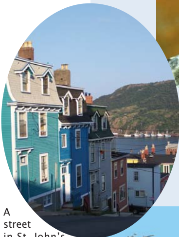
A street in St. John's