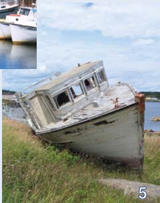
Top photo: Quidividi Village