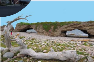
The Arches Provincial Park

Photos from top: Golf – courtesy Newfoundland & Labrador Tourism, Golf NF & LB; Puffin – courtesy Newfoundland & Labrador Tourism, Homer Green; Streetscape – courtesy Monika Schaefer; Arches – courtesy Newfoundland & Labrador Tourism, Hans G. Pfaff.