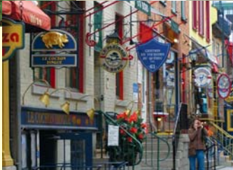
Rue de petit Champlain