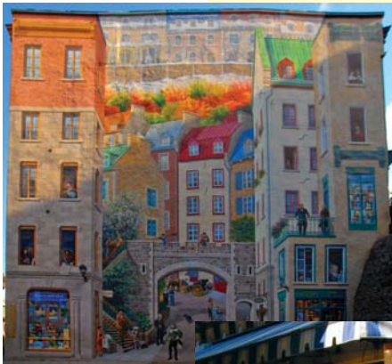
Fresque des Québécois,