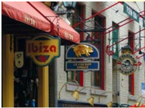
Rue de petit Champlain